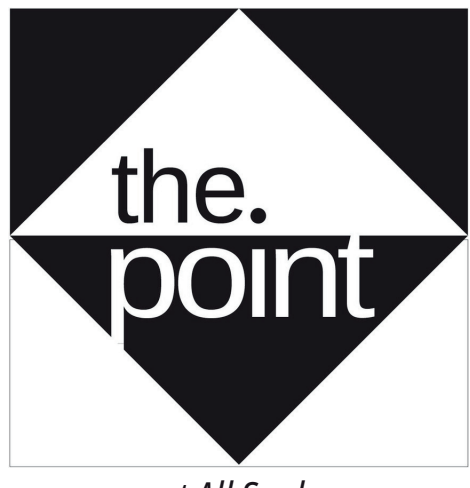
at All Souls

This service is live streamed to viewers around the world.