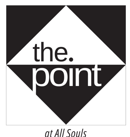
ut Ali Souis