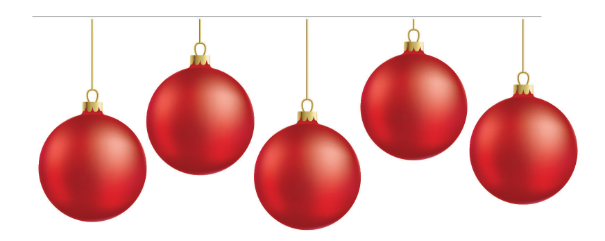
"For it isn't enough to talk about peace. One must believe in it. And it isn't enough to believe in it. One must work at it." —Fleanor Roosevelt