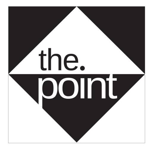
at All Souls

This service is live streamed to viewers around the world